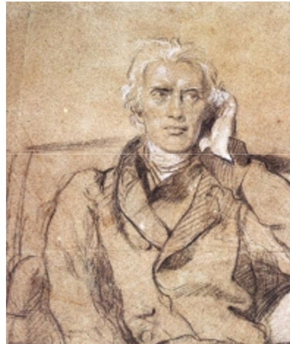
Sir Francis Baring